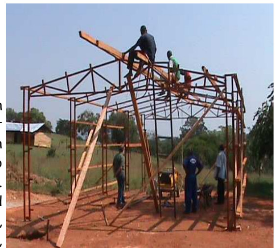
Erection of Beekeeping Project workshop