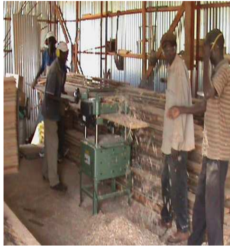
Production in the workshop

It's not how much you accomplish in life that really counts, but how much you give to others. It's not how high you build your dreams that makes a difference, but how high your faith can climb. It's not how many goals you reach, but how many lives you touch. It's not who you know that matters, but who you are on the inside. Believe in the impossible, hold tight to the incredible, and live each day to its fullest potential. You can make a difference in your world.