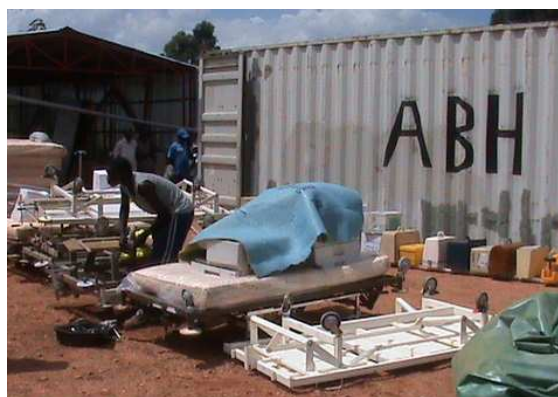
Immense joy for all involved: The container on site in Kaihura

This week four board members from Embrace Uganda (US organisation) visited Kaihura. They ran a seminar for married couples and held a pastors' conference on Thursday and Friday.